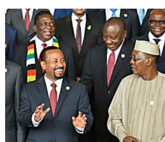
Why Ethiopia Sailed While...