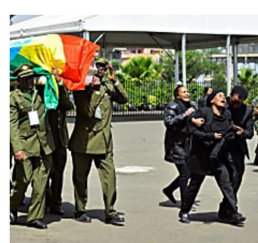
Political Violence Could Derail...