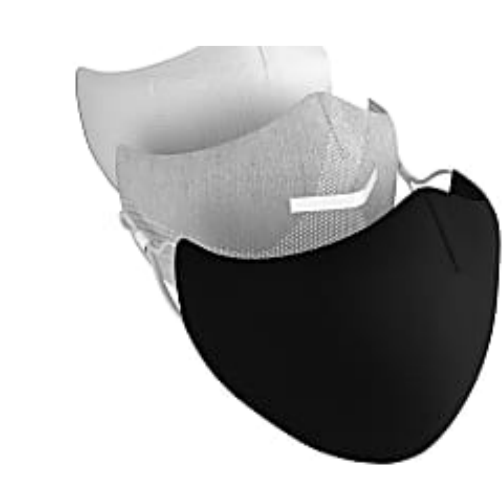
Is this the best mask you can bu... Smart Cover