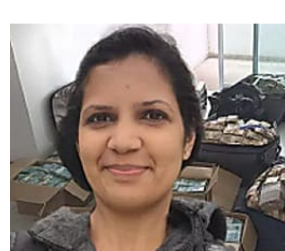
Amazon-aandelen: met slechts... boltraders.com