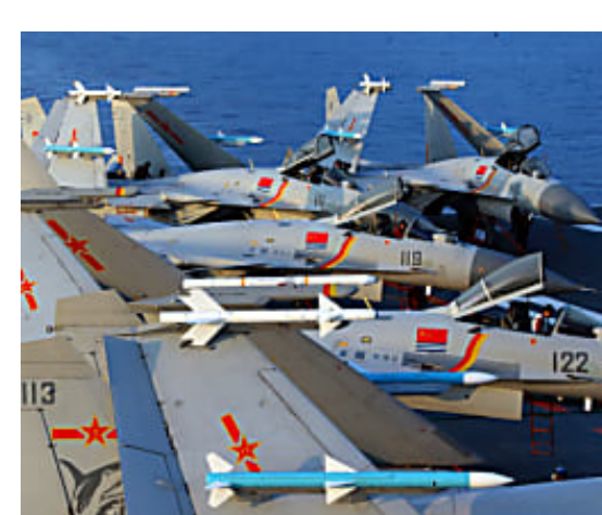
Slaughter in the East China Sea